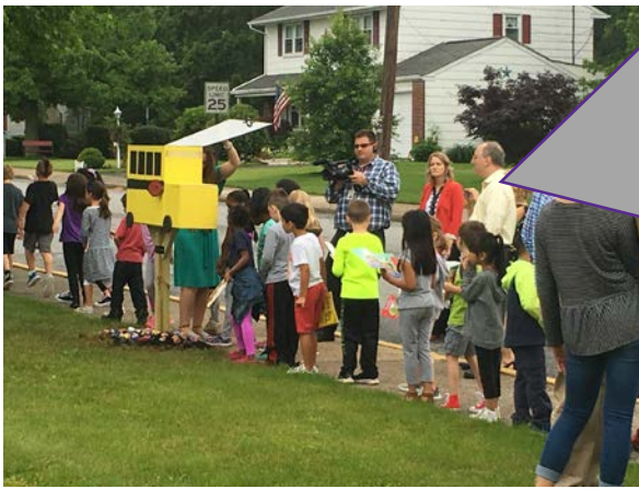
Little Free Libraries encourage reading and foster a sense of community