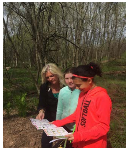
Worms, Woods & Wonder taking the classroom outside