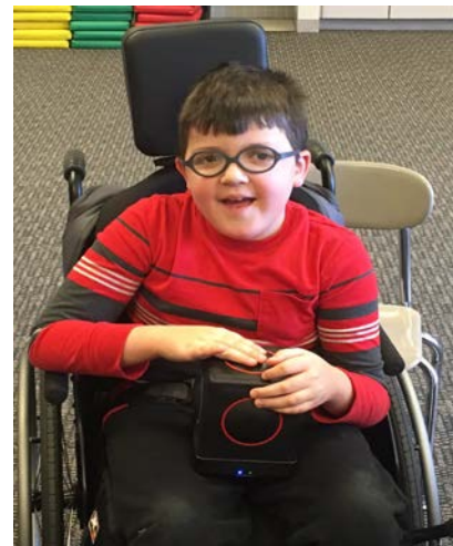
The SKOOG: Empowering students of all ages and abilities to play music