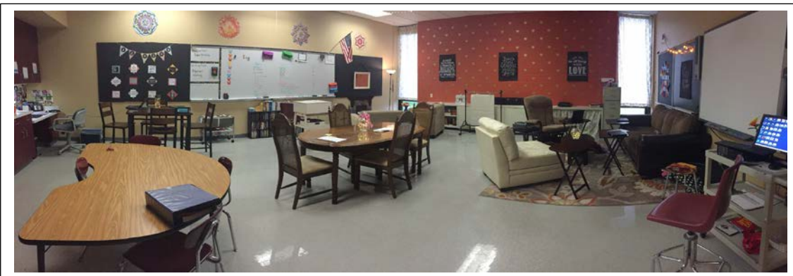
Top Left: Oak Ridge Elementary School Top Right: Souderton Area High School Bottom: Indian Crest Middle School

“The Indian Valley Education Foundation is an integral part of the SASD community. The teachers, counselors, and other professional members of the Souderton Area Education Association (SAEA) are distinctly proud of their work with the IVEF, knowing that our students are the sole of the beneficiaries of the Foundation’s efforts. As such, SAEA is proud to actively support the IVEF through our Community Outreach Fund, which has donated over $25,000 in the past six years. Countless SAEA members have and will continue to dedicate many hours of volunteer service to the IVEF. We understand how powerful this collaborative relationship is, for the sake of our students and the community at large.”