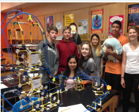
Learning Physics by creating roller coasters