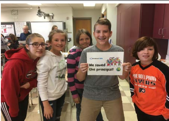
Problem solving & collaboration with Breakout EDU